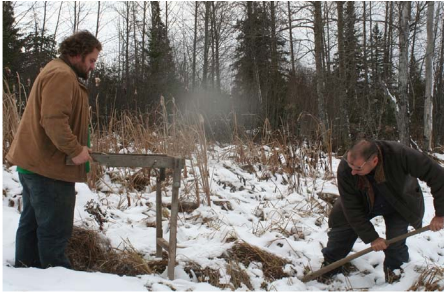
Plate 1: Conditions for test pit survey (Note: although snow covered, ground was not frozen.)