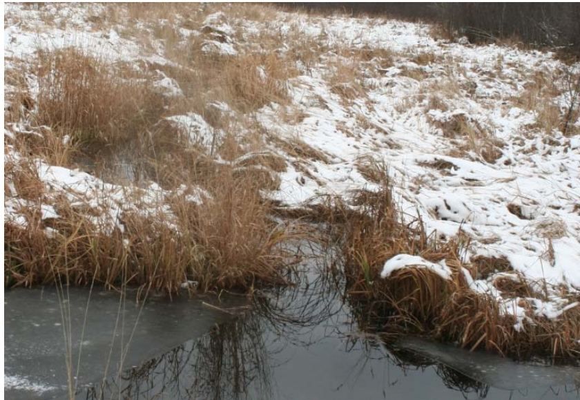
Plate 2: Photo of creek within subject property.