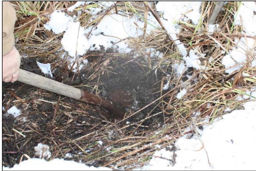
Plate 3: Note low, wet and saturated condition of test pit soils.