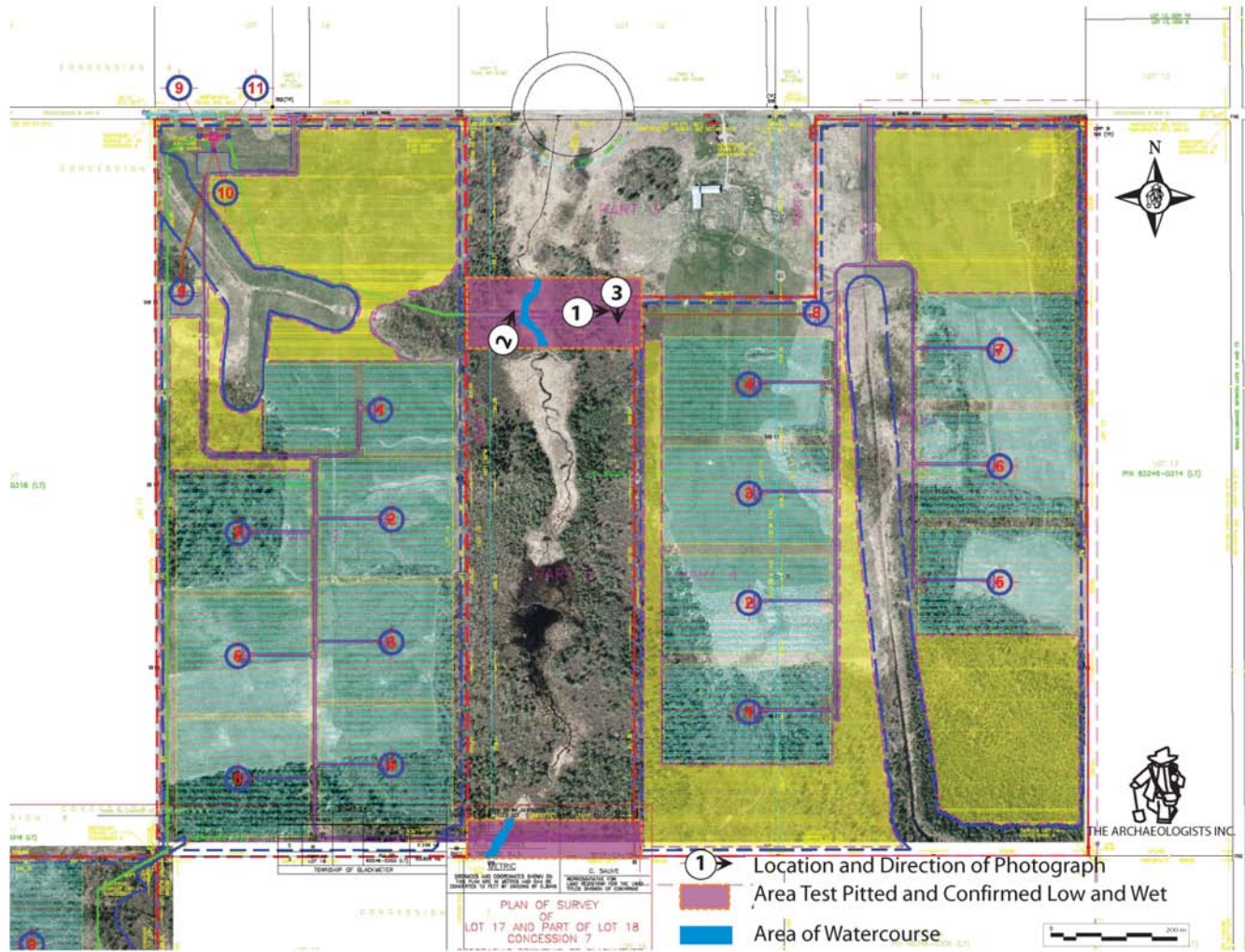
Map 3: Results of Stage 2 archaeological assessment within subject property parcels.